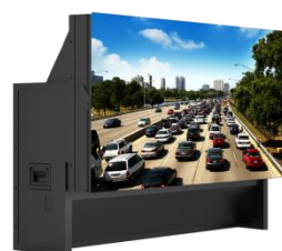
LED Light Source