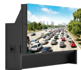
New Gen. LED Light Source